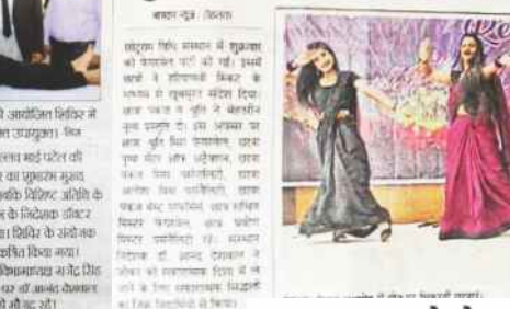
छोटूराम विधि संस्थान में आयोजित फेयरवेल पार्टी में गीत-संगीत पर खूब थिरके स्टूडेंट्स