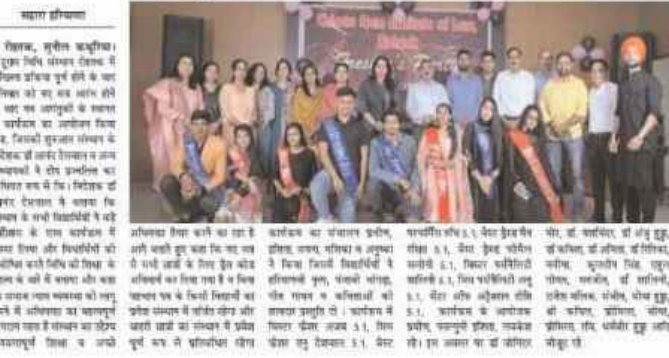
छोटूराम विधि संस्थान में दीपावली समारोह एवं फ्रेशर पार्टी का आयोजन