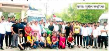
छोटूराम विधि संस्थान के छात्रों एवं स्टाफ सदस्यों ने सांस्कृतिक एवं शैक्षणिक भ्रमण के लिए की रवाना