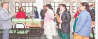
छोटाराम लॉ कालेज में आयोजित हवन कार्यक्रम का समापन करते संस्थान के सदस्यों का समूह।

रोहतक, 21 नवंबर (दोपहर) : छोटाराम लॉ कालेज में हवन का आयोजन किया गया। अपराध प्रकट होने पर ही अपराध प्रकट नहीं होता। दूसरा अपराध प्रकट नहीं होता।