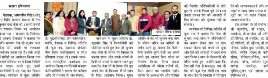
छोटूराम विधि संस्थान में किया पराक्रम संस्थान का आयोजन