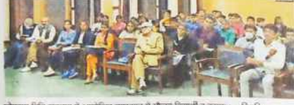
छोटूराम विधि संस्थान में आयोजित फेयरवेल पार्टी में गीत-संगीत पर खूब थिरके स्टूडेंट्स

रोहताक के लीजर इन्स्टीट्यूट ऑफ लॉ में आयोजित रक्तदान शिविर में रक्तदान करने वाले छात्रों का शुक्रार्पण किया गया।