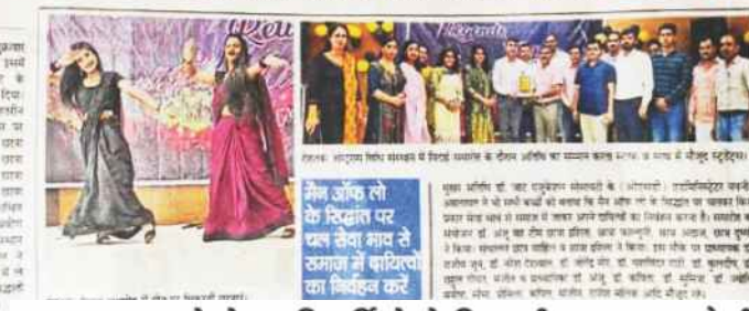
छोटूराम विधि संस्थान में आयोजित फेयरवेल पार्टी में गीत-संगीत पर खूब थिरके स्टूडेंट्स