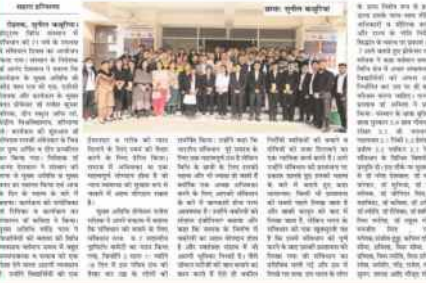
छोटूराम विधि संस्थान में मनाया सतिधान दिवस