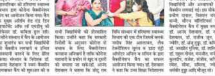
छोटूराम विधि संस्थान में कोरोना से बचाव को वैक्सिनेशन अनिवार्य