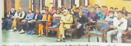
छोटूराम विधि संस्थान में आपदा प्रबंधन अधिनियम की दी जानकारी